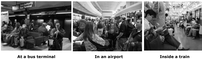
Figure 2. Selection of typical usage contexts

The extreme conditions of use (commuting) represent only a fraction of a day. Broadcast TV can be seen in many other usage contexts throughout the day, for instance, in the kitchen, in a café, at work as background environment or to keep up with the latest news, etc. To understand the requirements imposed by these usage scenarios, a further set of contexts of use were created, and furnished by carrying out a scenario-writing exercise. In the following we have chosen and abridged two examples of use scenarios.