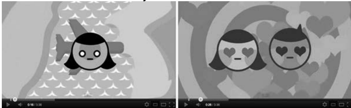
Figure 1. Long Distance Lover Screenshots

Using characterisation was an approach that 14 out of 18 design teams participating in this project used when telling their stories. For example, a group made up of students from the university in Korea, designed a camera that communicates with another by superimposing pictures together. 'Long Distance Lover', the story they told about this concept, describes a situation where a girl from their team falls in love with a boy from their partnering team during the gift-giving visit. The camera is used to maintain the relationship after the visit, placing their partnering team, or client, in a hero-protagonist role (figure 1). Another group comprising of students from the university in Taiwan, described how a journalist from Australia, their partnering team's country of origin, uses their concept to overcome difficulties in photographing Kangaroos.