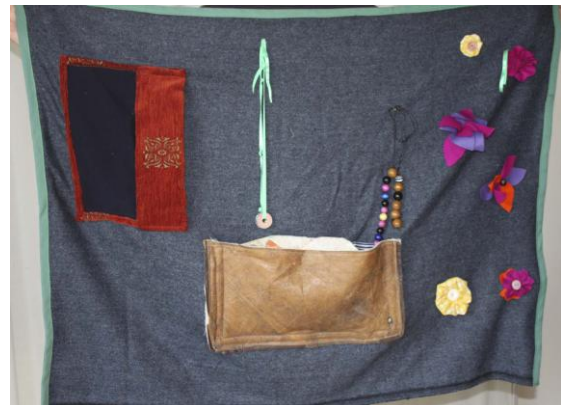
Figure 2. Dementia Blanket – John

The three groups consisted of 10 participants and each approached the design problem in different ways. Group 1 (designing for a PwD called John) chose to work in a relaxed environment, and share personal experiences before committing ideas to paper. The group worked with a theme of pockets exploring concepts of identity and surprise. The main focus of this group was on ensuring that the PwD would be comfortable with the design of the garment and the selection of appropriate materials was for them particularly important. The final design was a sensory blanket with pockets rather than an item of clothing since the group had been advised that this particular PwD objected strongly to wearing an apron (Fig.2). Great care and attention was paid to the textural qualities of the component parts, both the base cloth and the pockets. The proposed design was also to incorporate an easy to use digital camera as John had had an interest in photography as a younger man and the group felt that he would be likely to respond positively to images he captured himself viewed on a screen or tablet.