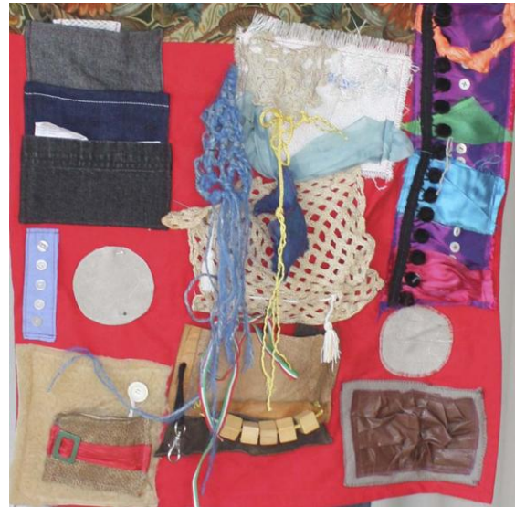
Figure 3. Dementia Apron – Ado

Group 2 focussed on working on a design for a PwD called Ado. They worked intensely, capturing written ideas on large pieces of paper developing a range of themes that they wished to represent in the design including Ado's preference for particular items of clothing, his various fields of employment and countries he had lived in. These themes were represented through bright silk scarves, the frontispiece of a blue business shirt, and a variety of men's suit fabrics (Fig 3). The textile elements within the apron were highly coloured and decorative incorporating stitched, knotted and embellished detail for fiddling with and to provide added sensory interest. In addition the blanket used conductive threads and fabrics to enable a soft contact switch to be embedded that could tap on and off with an easy hand gesture and produce light and sound responses.