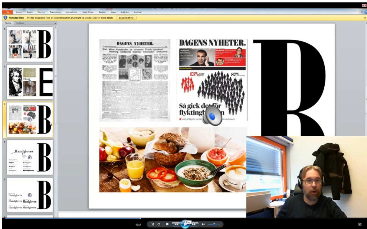
Figure 2. Example of one of the screen capture made in the study