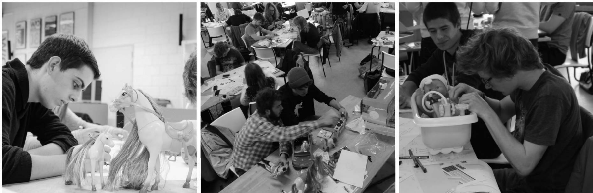
Figure 3. Students redesigning a toy based on the Value Matrix

In a short period of time the students had to come up with a wide variation of conceptual toy properties. They still had little experience with brainstorming, evaluating design concepts and decision making, but quick development of these skills was key to being successful in the assignment. Using the Value Matrix, the students felt restricted at first in hacking/adapting existing toys. After a while they found that the tool helped them to open their minds and see new possibilities. It guided and stimulated them to find new properties of the toys that could be improved since the evaluation of toys showed them clearly which properties were present in the current state and which were not. In the end they agreed that the restrictions imposed in the evaluating matrix were necessary to end up with fresh and creative ideas they otherwise would not have thought of.