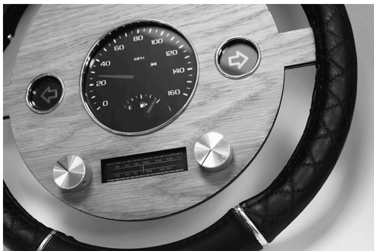
Figure 3. Steering wheel

On the first live lab evaluation the resident was recovering from surgery and reticent to hold the wheel or bring it close to his body. However, he did show interest in the object and was observed by the research team to become less agitated and stressed. On the second Live Lab evaluation day the resident's health was still very poor. Despite being told initially he was too unwell to participate, carers wheeled him through to the lounge area in a wheelchair with him holding the steering wheel as if he was in control of his vehicle. There followed a very playful session lasting about 20 minutes when two carers sat next to his wheelchair and play-acted a road trip to the seaside to buy ice cream. This included driving around bendy roads, parking the car, tuning-in the radio and driving home. The research team observed and noted the participant's body language and facial expressions and it was clear to all he was having a very good time. The care home manager reflected on this activity saying: 'We had a very personal journey, on a trip and he was driving us to Porthcawl. It was absolutely the most interaction I have ever seen from him. It was absolutely amazing... it was!' The steering wheel has been used subsequently by the resident and carers and has continued to bring him pleasure.