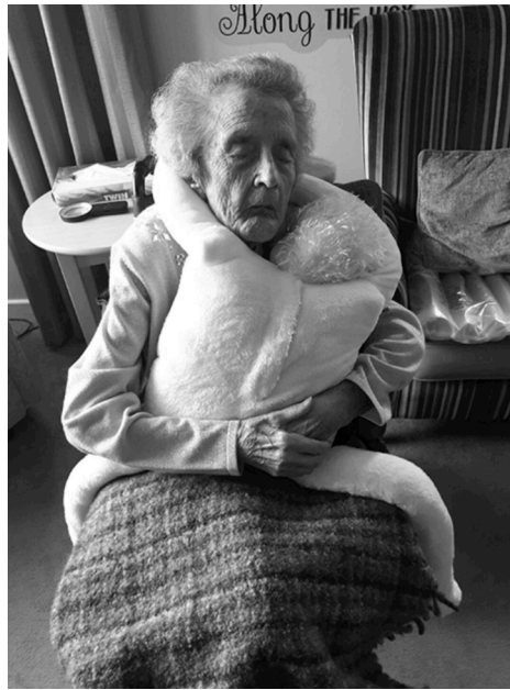
Figure 2. Hug

When the participant was first given 'Hug' she responded positively by holding it close, resting her head on it and closing her eyes as well as speaking a few words, to the amazement of the care staff. When the research team left and the resident returned to the dementia unit, her carer observed that she continued to hold it close and that when staff tried to remove it from her she cried and wanted it back. Three further live lab evaluation sessions (over a period of two months) in which the participant's facial expressions and body language were observed, confirm that she experienced comfort and pleasure from 'Hug'. The care professionals have provided further confirmation of this and report that her overall health has improved, falls have reduced, her appetite has returned and that she now speaks a little and socialises with other residents. Her carer confirmed this saying: