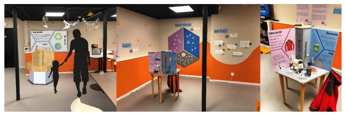
Figure 1. One of the design experiments from the Plastic Transformer project, exploring how a knowledge-carrying object interact with users and the surroundings

As mentioned above the playcentric approach was the main reason for the design project working with design experiments and observations intertwined and why it was carried out among the children visiting the local science centre. The design experiments were designed to explore different ways of how an object may disseminate knowledge but also to explore how the object interacted with both the environment it was placed in and the users. The result from an observation of the children's responses to the object and the placement of the object, influenced how the following design experiment were altered (Figure 1).