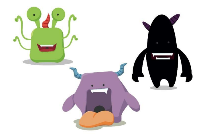
Figure 2. Personas used to explore the hypothesis "play or tell". The Plastic Transformer (purple) and the Recycler (green) teaches the Plastic Monster (black) how to act environmentally friendly