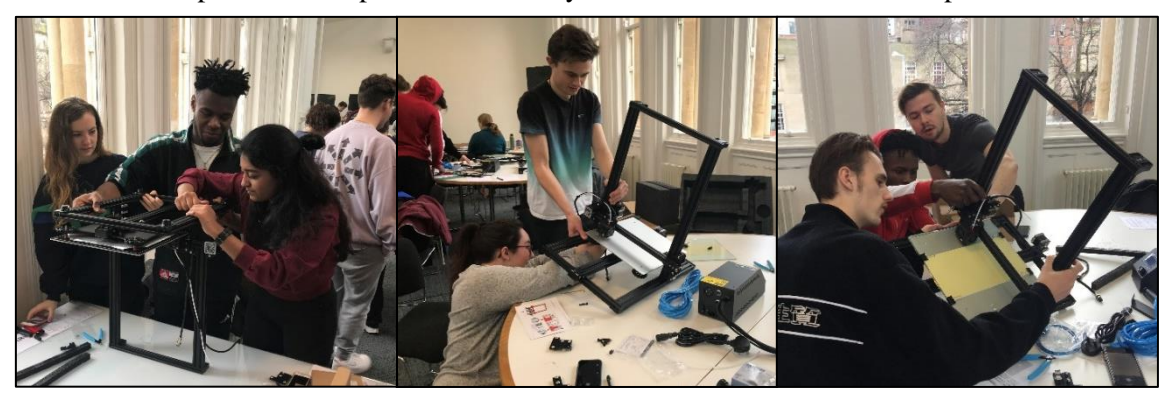
Figure 1. BSc Product Design Year 1 Students Building Creality CR-10S 3D Printers

The initial democratic manufacturing project was set to a group of sixty-seven BSc (Hons) Product Design first year students in the 2019/20 academic year. Students selected their pairings which were later collated into groups of four/five. Each student group was provided with a DIY kit for a Creality CR-10S 3D printer and were tasked to construct, calibrate, and produce test prints together (Figure 1). Each student group was provided with a set of simple instructions and a standard user manual provided with the printers to aid the initial constructions and assembly. Students could however use additional video tutorials and content available online or seek support from the tutors. The students were also tasked with documenting their construction process as part of the project, they were expected to produce a more detailed and informative user manual which could be shared with future student groups who would learn how operate the 3D printers when fully installed and located in the 3D printer farm location.