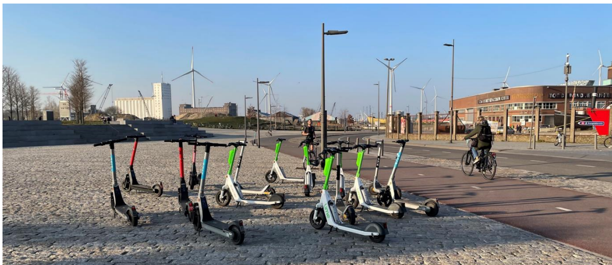
Figure 1. Multiple sharing scooters in the city of Antwerp (Vervoort; 2022)

Keywords: Electric scooter, micro mobility, last-mile, sharing economy, product-service system