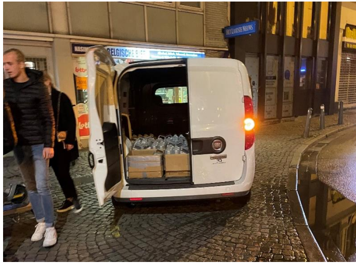
Figure 2. A fleet manager blocking the passage for pedestrians (Vervoort,2021)