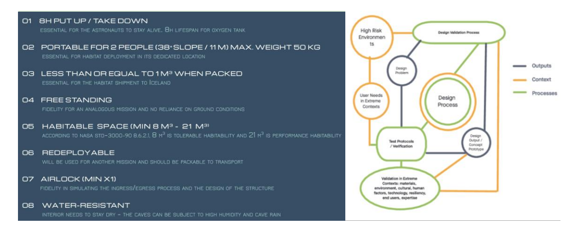
Figure 2. a) Design Criteria Hierarchy and b) Design Validation process

Design Educator's Experience: The "mission critical" requirement was for habitat set-up to require less than 8 hours, as that is the limit of the astronaut's portable oxygen supply. Other requirements to address include portability (load dimensions and weight) given the steepness of the terrain (Figure 1) and the need for the habitat to be freestanding within the basalt lava tube. Remaining criteria to address were the crew's use of the volume including: "minimal living and working space for the crew of three, for which multiplexing of areas will be vital! The space will need to provide: a hygiene area: somewhat shielded from the rest of the interior, minimal work and communications area, sleeping area, EVA suit donning, and storage (EVA suits, instruments, utilities)." The team-developed design hierarchy had eight criteria (Figure 2a);01-04 address survivability and 05-08 extended to habitability.