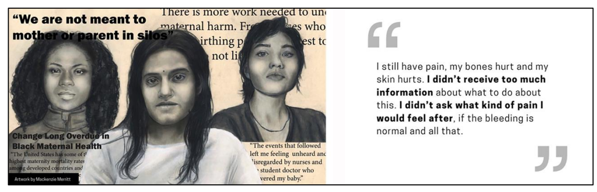
Figure 1. Slide show content

The second tool utilised quantitative data from maternal mortality and morbidity statistics reported from the Centres for Disease Control and Prevention (CDC) [7]. This data was presented as an interactive display, using Figma, on a touchscreen computer. The touchscreen display enabled specific interactions to address frequently asked questions around disparities in maternity care and communicate information in an interactive way. This was a user-driven experience, where visitors could explore questions and the associated answers at their own pace. The intent of this tool was to convey the magnitude of the problem in an accessible way.