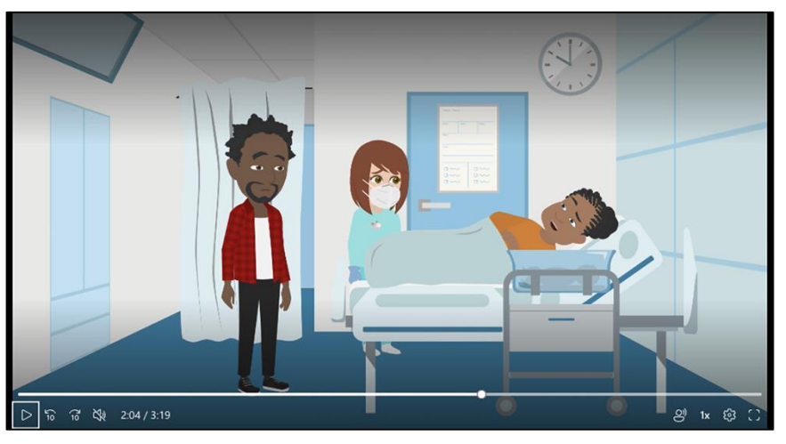
Figure 3. Screenshot of animated video display

The third tool developed to educate and inform visitors was an animated video display that shared lived experiences of birthing parents and their families in the postnatal unit. Through these animations, the visitors would be able to hear and see examples of interactions between patients and health care team members, learn about those experiences and, in some cases, verify their own experiences. The goal with this portion of the exhibit was to use digital stories as a provocative artifact for discussion, inviting people to view, question, and reflect on the inequities of postpartum care [8].