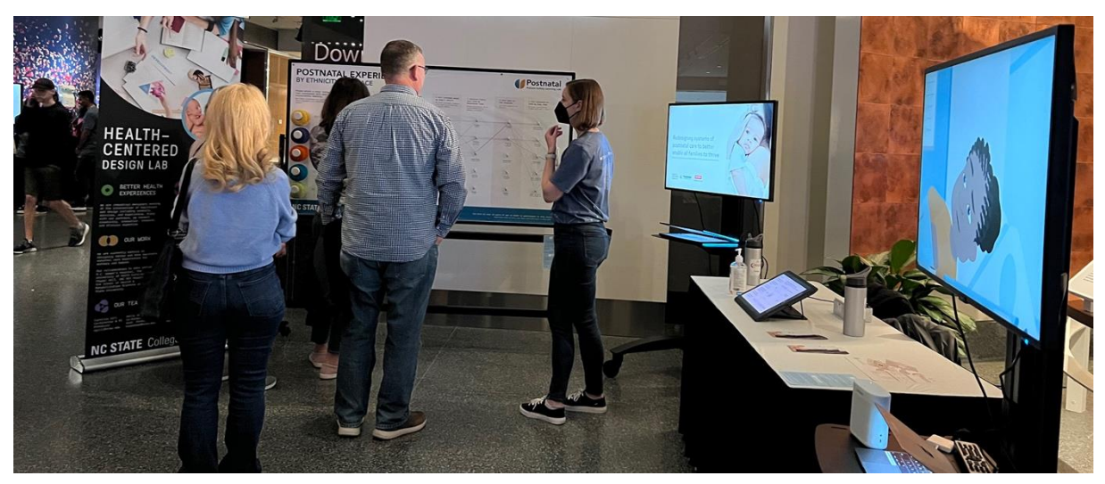
Figure 5. Exhibit in use

The exhibit was open to the public for three days from Friday, April 8 – Sunday, April 10, 2022, 10am to 5:30pm. During this time, two industrial design faculty and four research assistants staffed the exhibit in pairs during four-hour shifts. The museum reported approximately 11,000 visitors to the museum each day. The design research team conducted a group debriefing session at the conclusion of each day to record notes on the responses from exhibit participants.